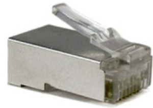
RJ45 Shielded Connector Cat 6a / Cat6