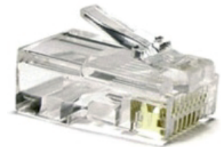
RJ45 Un-Shielded Connector Cat 6a / Cat6