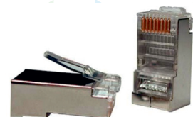
RJ 45 Shielded Connector Cat 5e